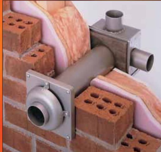
Standard Above Grade Vent Kit can be cut to fit 5" to 32" wall thickness. Diameter of wall opening is only 3-1/2".