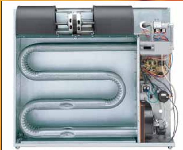
Tubular Aluminized Heat Exchanger enhances efficiencies and carries a 10 year warranty with no pro rata.