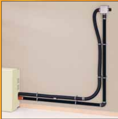
OPTIONAL: HEVK-5 5' Vent Exhaust Kit Includes one (1) 6' Black Flex Intake Pipe, (1) 5' Flocked Exhaust Tube, (2) 3" Couplings, (3) Support Brackets, (3) 2" Hose Clamps. (NOTE: 15' maximum with three [3] vent exhaust kits.)