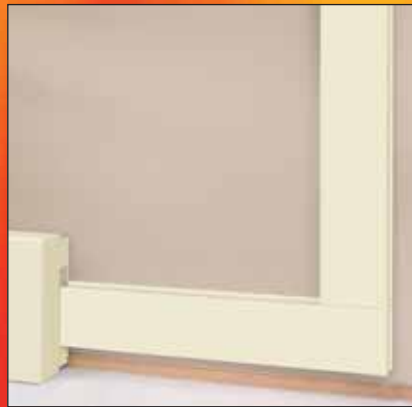
OPTIONAL: HEVE-5 Vent Enclosure Kit Includes one (1) 5' Enclosure Body, (1) End Cap, (1) 24" Section Flexible Trim Strip.