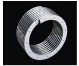
316Ti stainless steel Inox-Radial heat exchanger