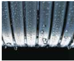
Stainless steel Inox-Radial heat exchanger