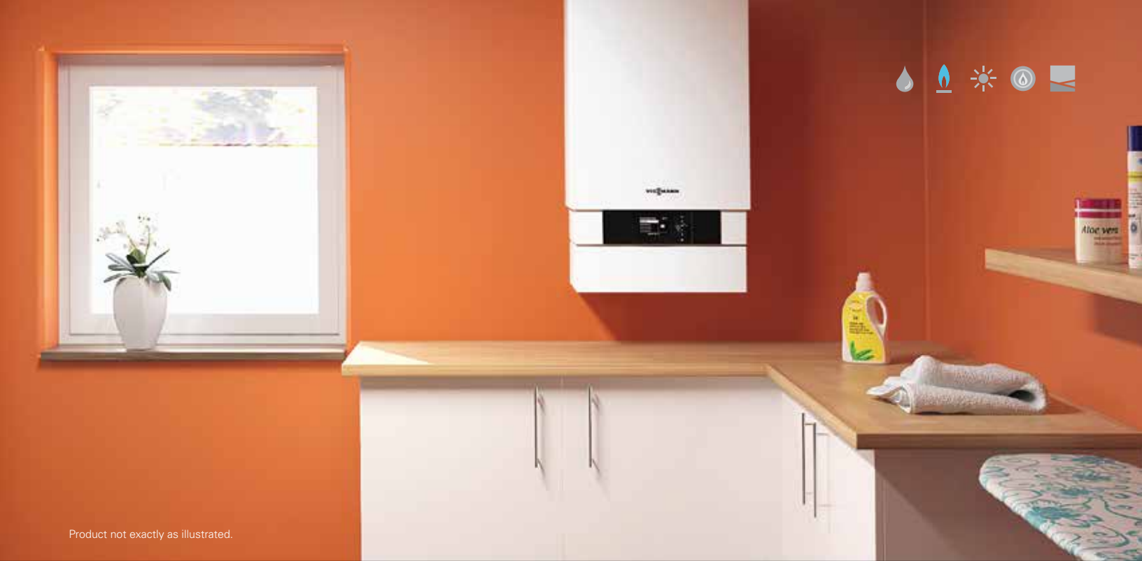
Product not exactly as illustrated.