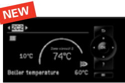
Vitotronic 200 control with new Setup Wizard

The Vitodens 200 models (sizes 18,68 to 80,285) are ENERGY STAR® qualified. By choosing the Vitodens 200, you are helping to promote cleaner air and a healthier environment.