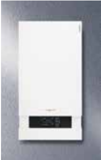
Vitodens 200-W gas-fired wall-mounted condensing boiler Multi-boiler installation - 32 to 4240 MBH for models 45,160 to 150,530