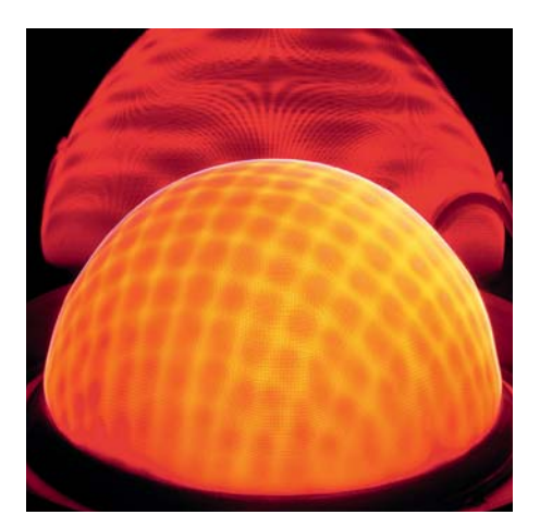
The MatriX dome gas burner for exceptionally low-emission combustion, making it a milestone in heating technology.